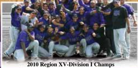
2010 Region XV-Division I Champs